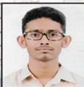
SAMPAN MANNA XI